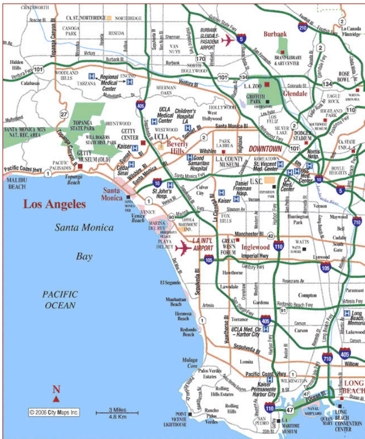
Figure 1: Hospitals Map of Los Angeles, California, City Maps Inc., (2006).

through providing credit for property purchases, allowing healthcare providers use of city eminent domain powers, and assisting in the development of parking facilities. To Tom Priselac in 2010, therefore, the future of the Los Angeles healthcare industry must have looked bright.