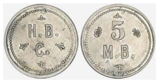
The company introduced a silver variant of the M.B. token in the 1790s

Rupert's House was the first trading post in Rupert's Land, founded on the eastern side of James Bay (Hudson Bay's southern arm) in 1671. Fort Albany and Moose Factory soon followed, helping the company establish its presence on the Abitibi and Moose Rivers. After an initial phase of consolidation, the Hudson's Bay Company built Port Nelson (later renamed York Factory) in 1684; it would continue operating out of the site for the next 270 years. York Factory was key to the Hudson's Bay Company's foothold in the fur trade, located on the narrow peninsula that separated the Hayes and Nelson Rivers – two rivers that ran deep into the continent's fur-sourcing interior.