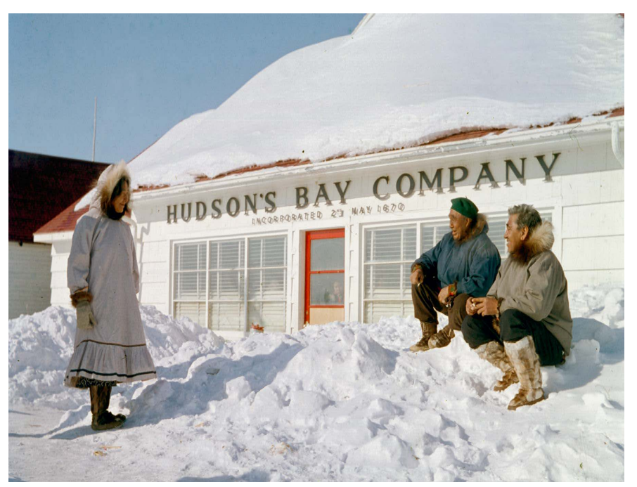
Aklavik, Northwest Territories (1956)

became majority shareholders in the Hudson's Bay Company in 1863. The new controlling party displayed little interest in struggling along in a contracting fur trade, instead bringing new priorities. In particular, its investors had high hopes of profiting from real estate speculation and economic development in the expanding Canadian West.