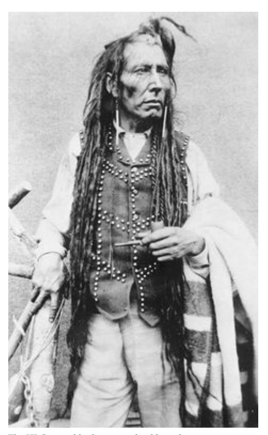
The HBC point blanket was valued by indigenous communities, and consistently in demand at trading posts

Often buying on behalf of wider indigenous communities, traders purchased a diverse range of European products with their beaver pelts. Producer goods such as guns and hunting supplies were always in demand, as were household items related to food preparation and warmth. From the 1730s onwards, luxuries like tobacco, cloth, jewellery and alcohol also became sought after at posts.<sup>21</sup>