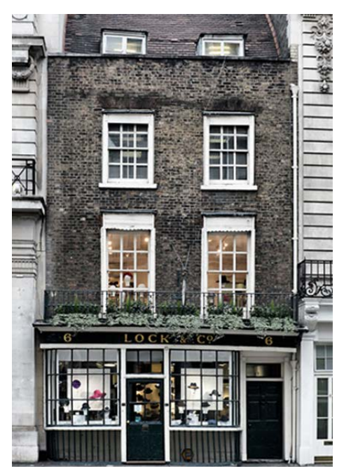
Lock & Co. Hatters can still be found at No. 6 James's Street in London today

considered international trade a vital national asset through which they could strengthen global influence. Plus, in a period of frequent, resource-draining conflict, the commerce accumulated through trading empires provided much-needed raw materials, domestic employment and tax revenues. However, the relevance of monopolies like the Hudson's Bay Company to Britain ran deeper than simply their value as lucrative sources of taxation or vehicles for colonial expansion: there was also a powerful demand-side phenomenon behind these global trading companies' successes.