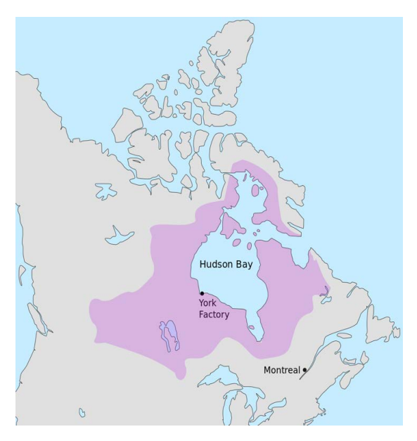
Rupert's Land, the vast region granted to the Hudson's Bay Company following Charles II's royal charter

They managed to attract the attention of Prince Rupert, cousin of Charles II, and secured funding for an initial expedition to the bay. The first two ships set sail for Hudson Bay in 1668, and returned the following year boasting a large haul of premium furs. A suitably impressed Charles II soon issued a royal charter in May 1670 that granted significant powers to "the Governor and Company of Adventurers of England trading into Hudson Bay". With this, the newly-formed Hudson's Bay Company gained exclusive rights to trade in – and colonise – the entire Hudson Bay drainage system known as "Rupert's Land".